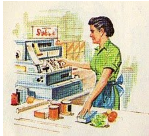
teller or cashier