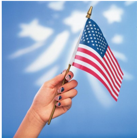
Fourth of July