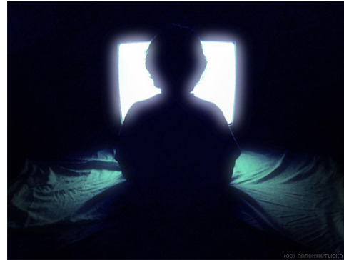
watch, to look